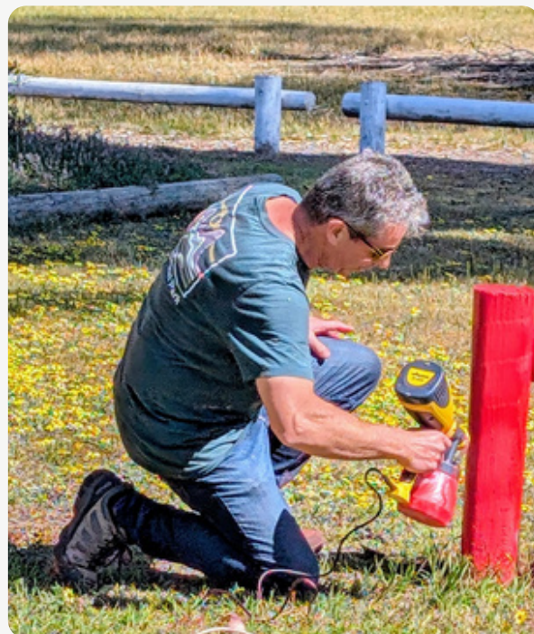
The CFI leading the way