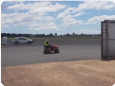
Summary of last week's operations 😊