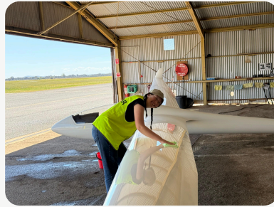
Mandy giving XJJ some extra love.