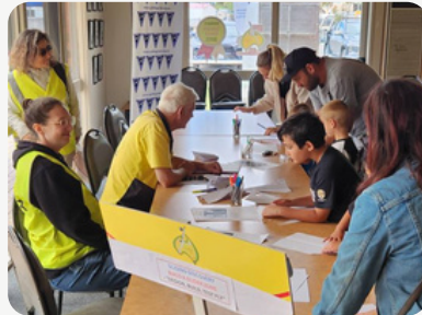
Benalla festival, paper planes competition!