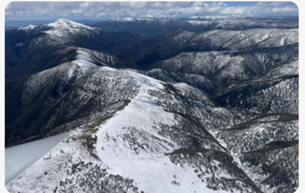
Meanwhile, in the hills...