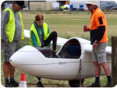
Benalla festival, take the pilots's seat