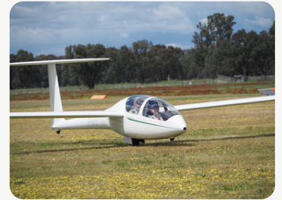
Greg Hammond with a happy passenger