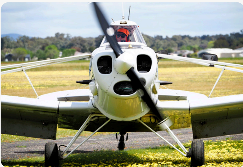
Roger on duty last weekend — photo by Zero Partos.

JOIN "TEAM INSPIRE" BY COMPLETING THE FORM VIA THE LINK