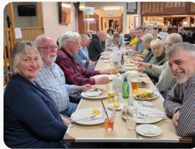
Friday night dinner with the A-Team at the Golf Club – good turnout, the soaring season must be about to start!