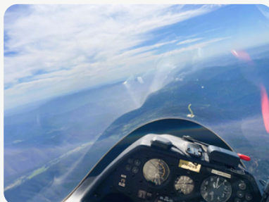
Mark was at Mt Beauty, great spring conditions