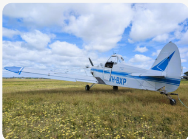
BXP is ready for action!