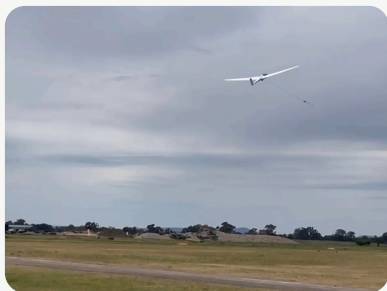
A huge success with winch operations last weekend!